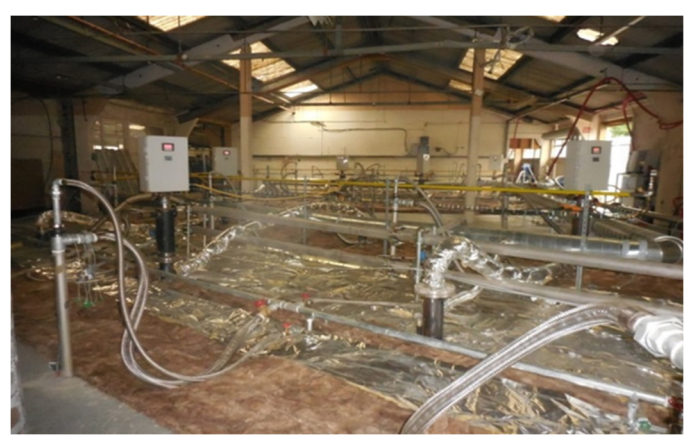
Figure 2: Heating and recovery well array.

The wells were linked to process equipment, which included pumps, soil vapour extraction blowers, a heat exchanger, inlet tanks and carbon vessels for treatment of vapour and liquid phase. The completed installation is shown in Figure 2.