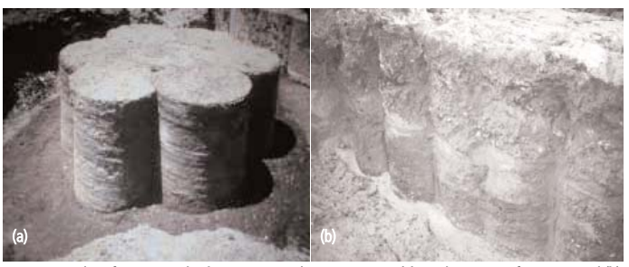
Fig 2. Examples of constructed columns using soil mixing augers: (a) overlapping configuration and (b) barrier wall configuration.

Mechanical mixing : This approach utilises equipment such as mixing augers (Fig 1b), backhoes and blenders or mixers. Mechanical mixing using augers results in the formation of monolithic contaminated material-binder columns by mixing the binder with the contaminated material in-place using hollow mixing augers. The columns are usually either constructed in an overlapping configuration to ensure complete treatment of the contaminated area or to form a barrier wall around a contaminated site as shown by the exposed columns in Figs 2 (a) and (b) respectively. Soil mixing can be deep or shallow. Deep mixing is usually carried out using augers while shallow mixing can be carried out using one of a number of equipment types including augers, backhoes, blenders or mass stabilisation tools.